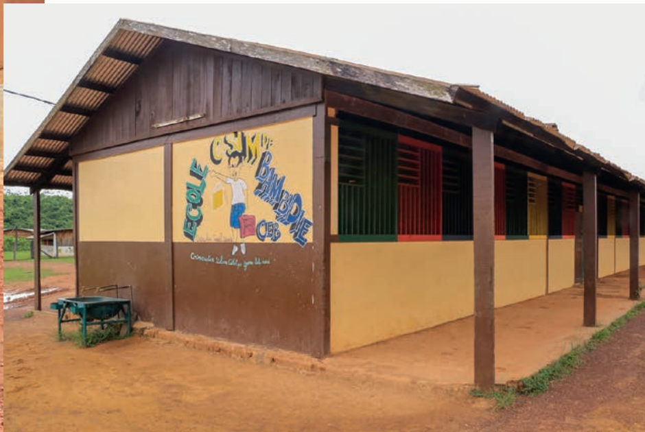
Picture large: Houses in Gabon Picture small: School in Bambidie, Gabon

The social aspect of our sustainable work is key to us. Responsibility towards employees and communities is what sets us apart.