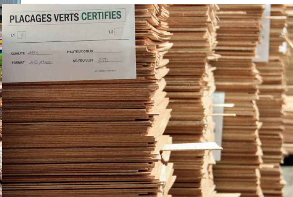
Picture large: Power plant in Brazil, MIL Energia Renovável Ltda Picture small: Veneer, produced in veneer factory in Gabon